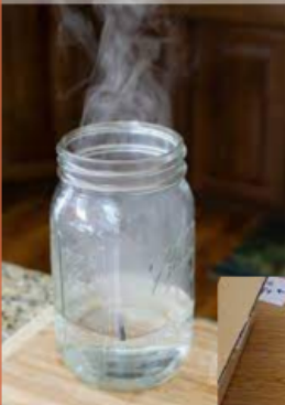
CLOUD in a JAR Experiment