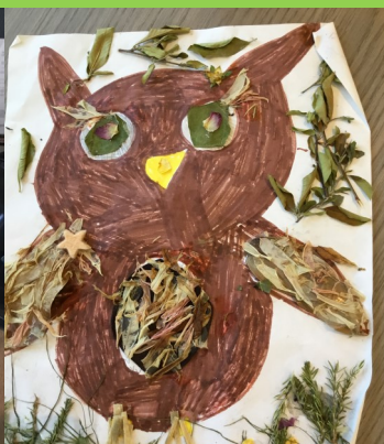
2nd Place - Alice