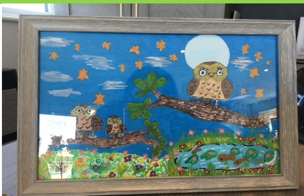
1st Place - Holly W