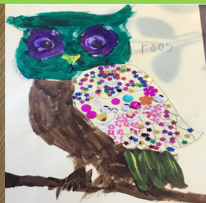
3rd Place - Amelie