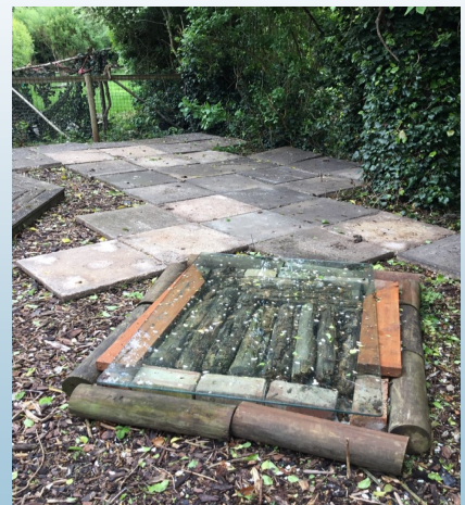
Our new bug viewing table.