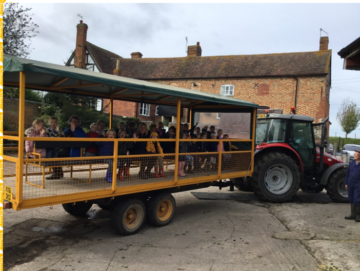
Year R 1 2 Farm Visit—White Ladies Aston

There are currently 8-10 jumpers and cardigans un-named and unclaimed in their classroom. Some items are brand new. Please call in to claim them or they will be added to our uniform sale.